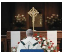
YOU ARE CALLED An Hour before the Lord Why Adoration Matters